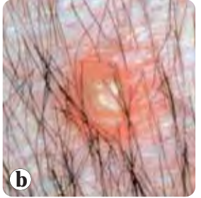
Figures 1 a and 1 b. Almost total alopecia and crusting on a Cocker Spaniel with a 6 month history. Careful examination of the dog revealed a few pustules (Figure 1b).