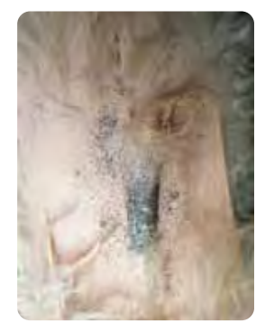
Figure 10. Comedones, in a case of hyperadrenocorticism.