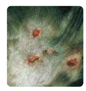
Figure 12. Sinus formation is usually a sign of deep pyoderma, panniculitis, atypical mycobacterial infection or deep fungal infection.