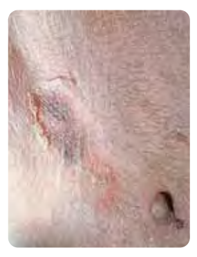
Figure 9. Epidermal collarettes, typically associated with superficial pyoderma.